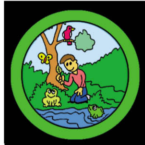
EXPLORE IN DESIGNATED AREAS